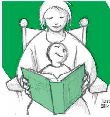
Illustration by Billy Nuñez, age 16